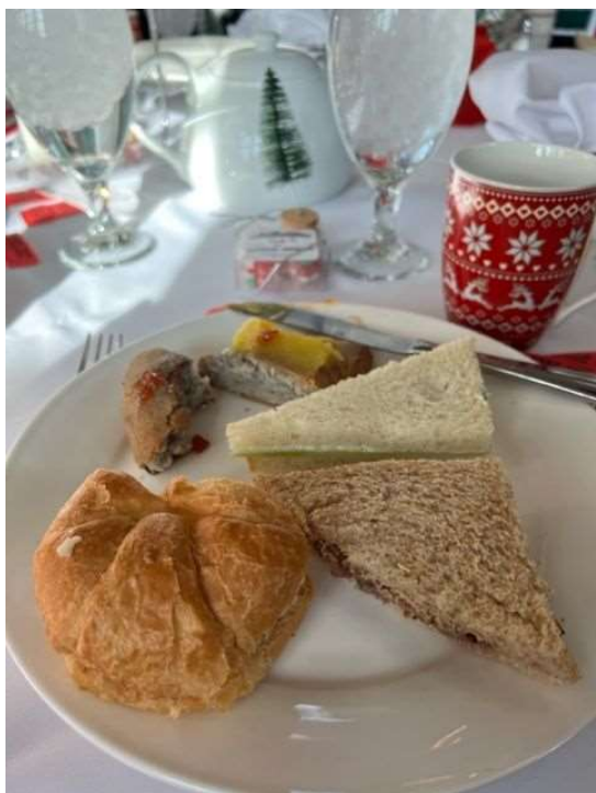
Traditional Tea Fare