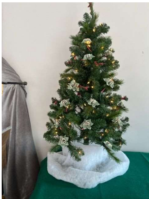
We always have a Money Tree$$$$