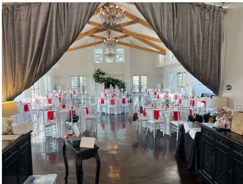
Beautiful Tea Room