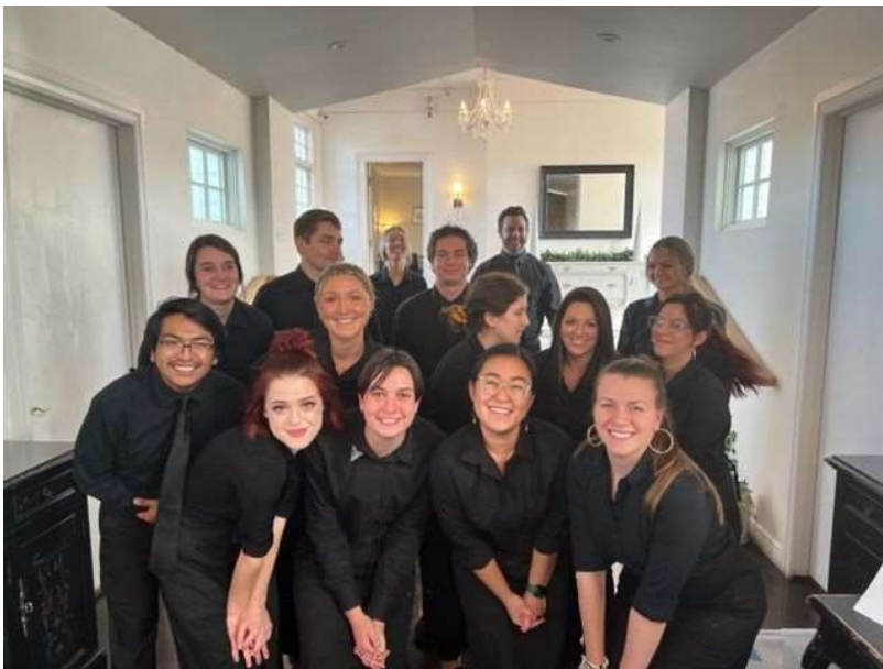
The wait staff at Manor House