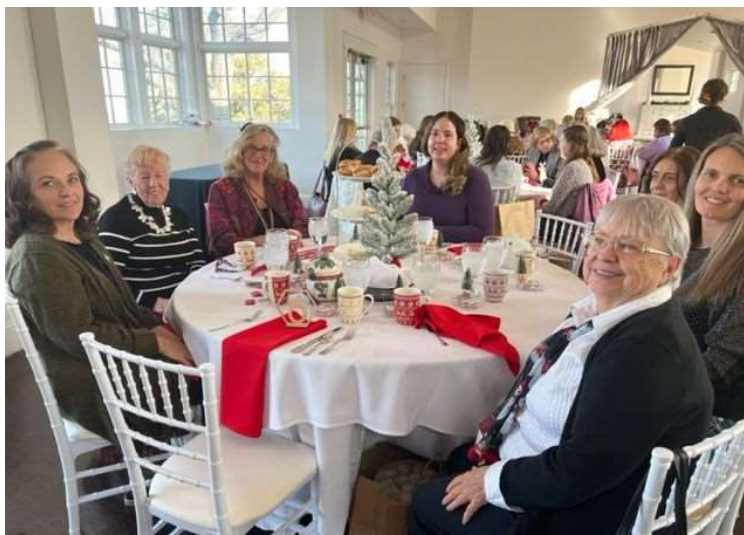
A Few of the Tea attendees