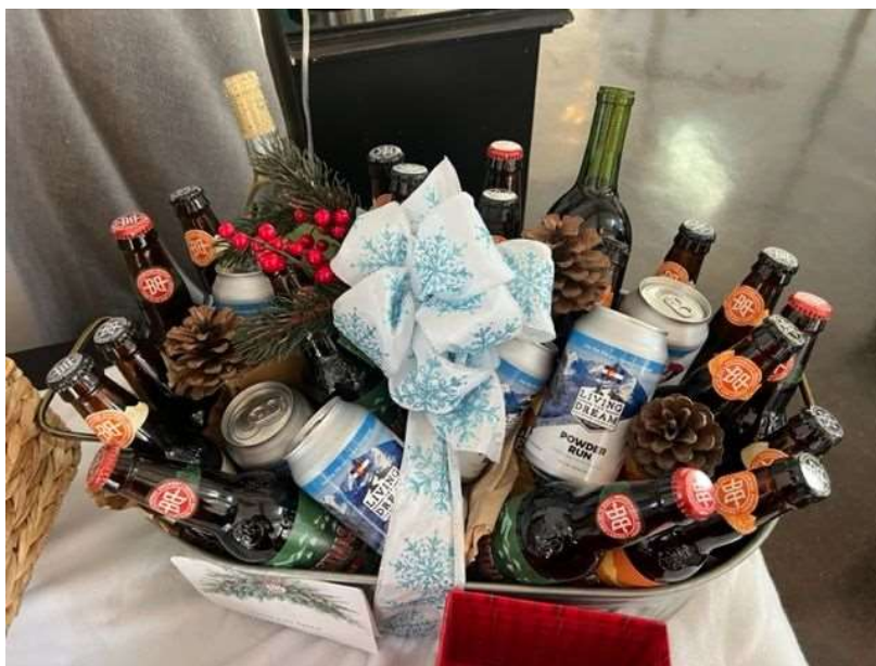
Just one of our many Raffles