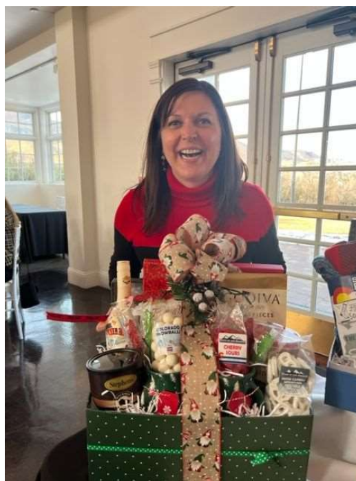
One Happy Winner!