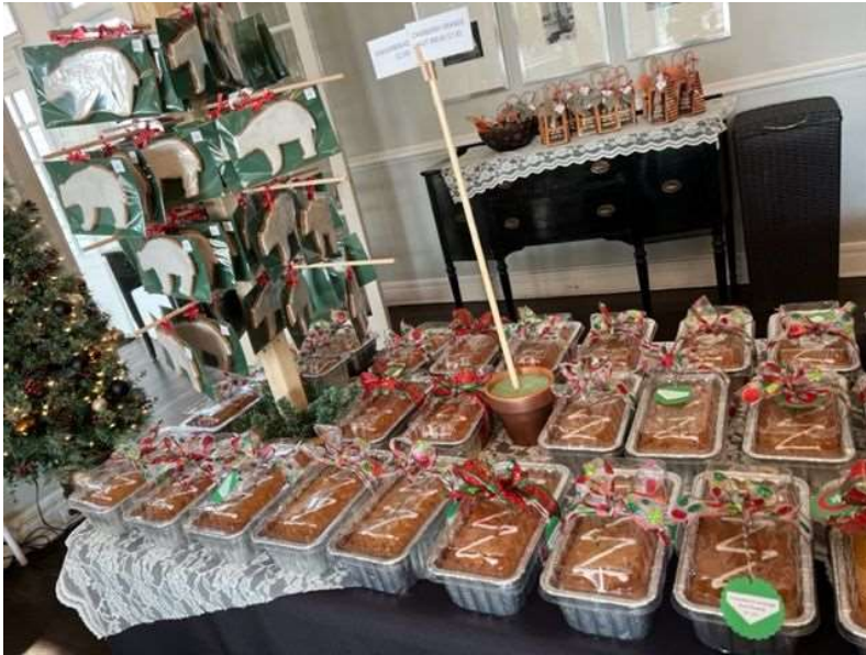
Just a snapshot of the Bake Sale

Just a peek at some of the items at our Bake Sale. It is almost impossible to show it all to you, you have to be there!