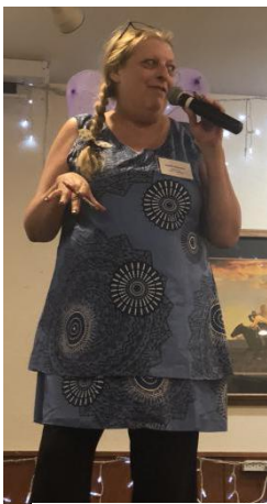
Introductions "Let's get this party started"

Our Hostess Chapter for the weekend, Beta Epsilon, did a unique theme this year, in that we didn't have any Convention Raffles. Instead, each event focused around a Philanthropic event we do in ESA. Friday nights theme was St. Jude/Breast Cancer Awareness. Beta Epsilon makes bras, with varying themes each year for an event they do. They brought A LOT of bras from all the years they have been doing this event!